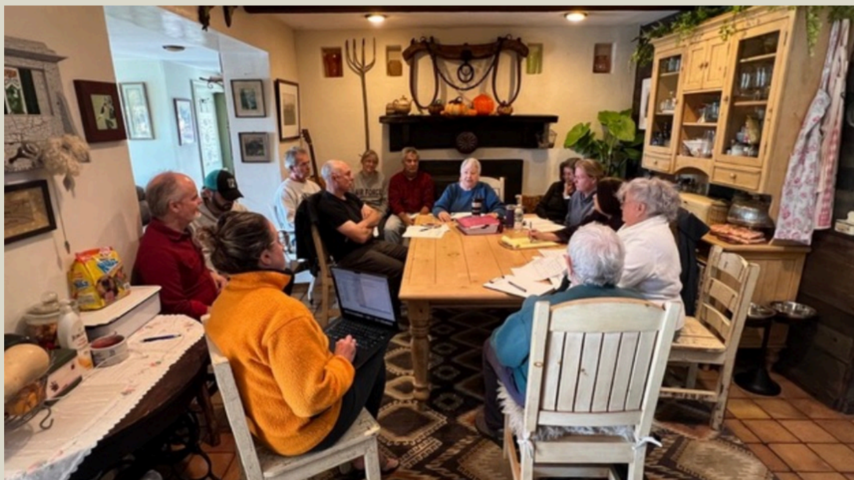
The current board meeting last fall

Apply now by contacting Cyndi at ckburr2@gmail.com or Denise at valleyoutreach@aol.com .