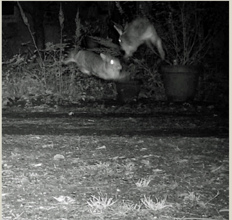
Rabbits Courting